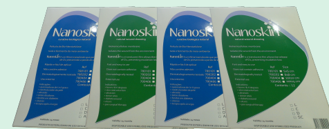
10x15 cm 8x8 cm 5x5 cm

Manufactured by Innovatec's Pesquisa e Desenvolvimento Biotecnologico Ltda - ME