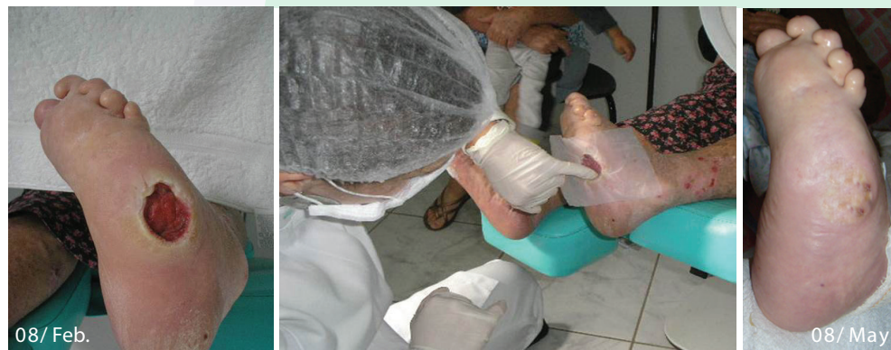
[ 2 ] Bs.kim Bs, CE, A.Atala, world J urol - 18,2,2000