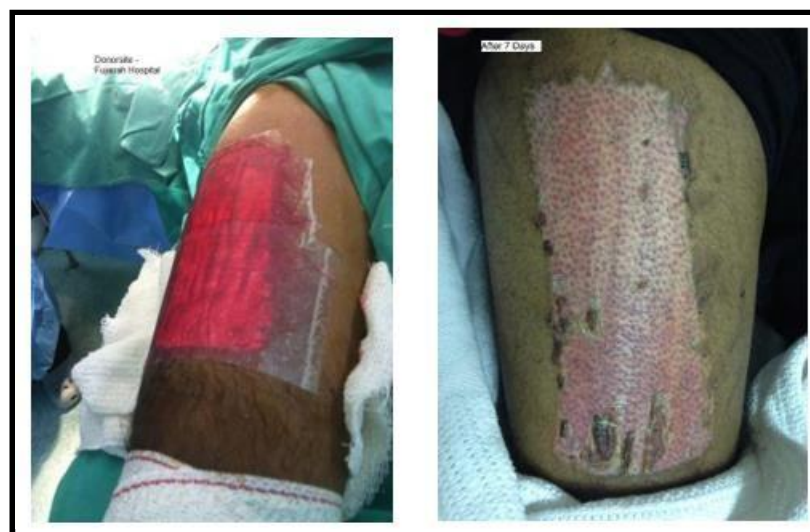
Figure 4: Complete wound healing in donor site case With Nanoskin-ACT.