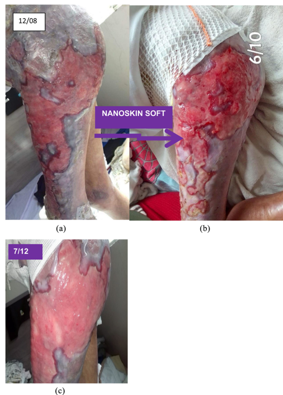
Figure 2. The evolution of Eb treatment by Nanoskin ACT, and Nanoskin ACT soft. (a) before treatment, (b) after 2 months treatment intense red color, (c) after 4 months with new skin regeneration.

Child one year old with Stevens-Johnson syndrome, Figure 4 shows the baby before treatment (a). (b) after applying Nanoskin ACT and Nanoskin ACT SOFT, treatment has been started with interval time changing every 48h and Nanoskin ACT SOFT, (c) complete healing.